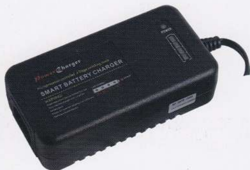
EP6012XX series Size:120x67x37mm Weight:300g

AC 100~240Vac AC input for worldwide used with interchangeable AC cord C13 inlet Perfect for charging SLA/GEL/AGM/VRLA/Lead acid battery 12V~36V 12~60Ah Build-in MCU Chip, programmed 4-stages charging process with 4LED's battery indicator, multiple protection OCP,OVP, Short-circuit, polarity reversed.