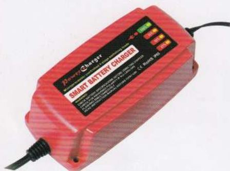
EPA12XX series Size:150x70x56mm Weight:400g

AC 100~240Vac AC input for worldwide used with interchangeable AC cord C13 inlet Ideal for charging SLA/GEL/AGM/VRLA batteries, Car/Marine/Mobility/Solar Applications Build-in MCU Chip, programmed 4-stages charging process with 4LED's battery indicator, multiple protection OCP,OVP, Short-circuit, polarity reversed.