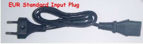
EUR Standard Input Plug