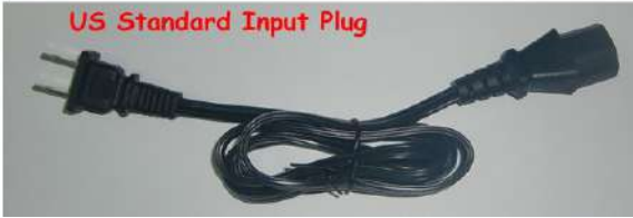
US Standard Input Plug