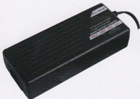
EPA100-XX series Size:170x71x41mm Weight:400g