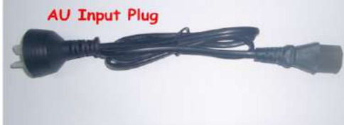
AU Input Plug